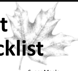
Sugar Maple Acer saccharum