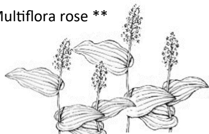
Canada mayflower Maianthemum canadense