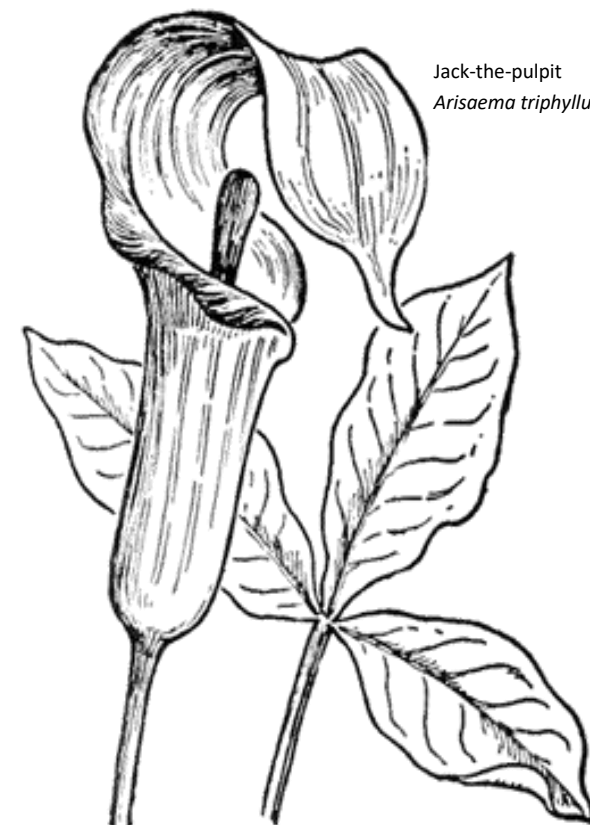
Jack-the-pulpit Arisaema triphyllum

Welcome to our first checklist of the trees, shrubs and flowers of the forest. This list will grow with the help of each new observation you provide! See you in the woods.